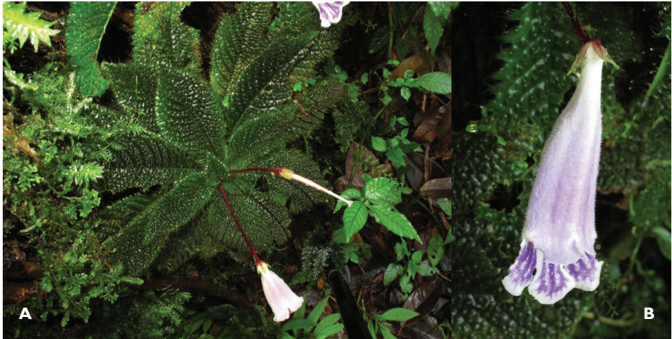
Figure 1. Ridleyandra chuana Kiew. A habit B flower.

mm, pedicel dark maroon-purple, 5–7 mm long. Flowers with sepals divided to base, dull purple or pale green with a red midrib, lanceolate, 4–7.5 × 1.5–2.5 mm, hispid; corolla funnel-shaped, 3–4 cm to tip of lower lip, tube 2–3 cm long, ca. 2 mm diam. at base dilating to 10 mm at the mouth, outside minutely pubescent, white at the base becoming tinged purple at the tube dilates, inside white with mauve or purple lines with 3 lines extending into each of the three lobes where they spread and coalesce leaving a white margin around each lobe, lobes projecting ca 10 mm beyond the tube, lateral lobes ca. 4 × 5 mm and the centre lobe ca. 5 × 6 mm; stamens 4 in 2 pairs, filaments white, lower pair ca. 23 mm long, upper pair ca. 26 mm long, anthers creamy white, ca 1 mm long, joined in pairs, staminode ca. 3 mm long; nectary annular, ca. 1 mm high; ovary ca. 3 cm long, pale mauve, stigma white, broadly spatulate, ca. 2 × 1.5 mm long, apex emarginated. Capsules glossy, deep purple, slightly curved upward, glabrous, 5–6.5 cm long, 2.5–4 mm diam., sepals persistent and clasping the base.