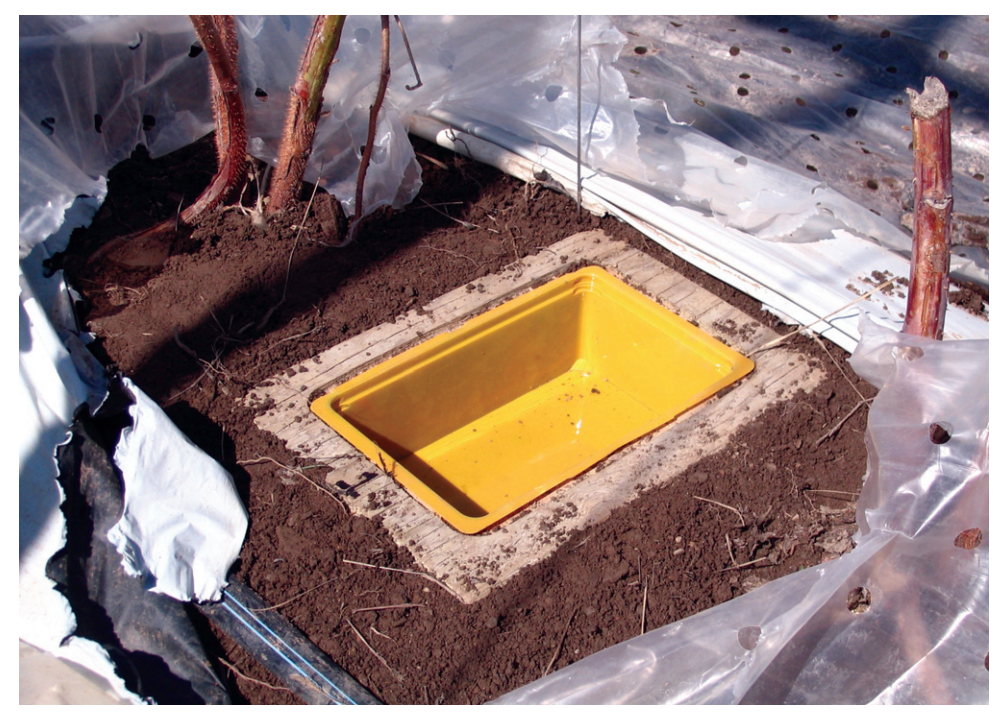
Figure 1. Yellow pan traps used for capturing specimens of Micromus variegatus.

CNC Canadian National Collection of Insects, Arachnids and Nematodes, Agriculture and Agri-Food Canada, Ottawa, Ontario, Canada