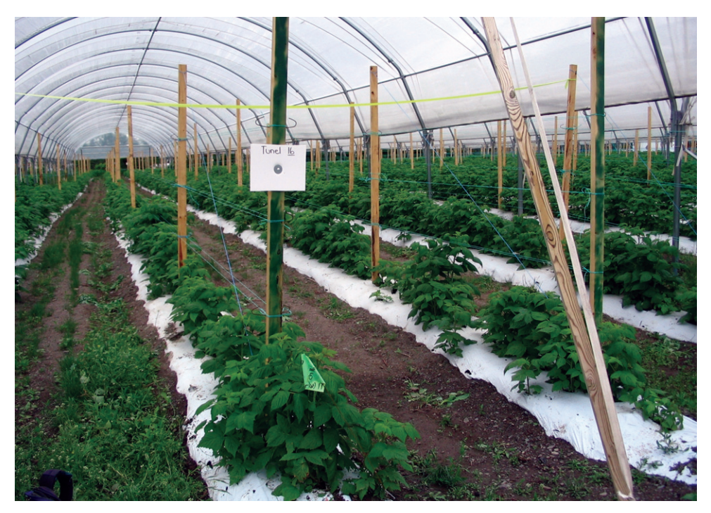
Figure 2. The cultivated imported variety of raspberries Rubus idaeus 'Autumn Britten' grown in tunnels in Québec where M. variegatus specimens were found.

According to the CFIA (2009) Web site, the cultivar 'Autumn Britten' is the result of a controlled cross made in 1974 between 'EM 2806/86' and 'EM 2335/47'. The parentage includes Rubus strigosus Michx., R. arcticus L., R. occidentalis L., and the red raspberry varieties 'Malling Landmark', 'Malling Promise', 'Lloyd George', 'Pyne's Royal', 'Burnetholm' and 'Norfolk Giant'. 'Autumn Britten' was grown at Horticultural Research International in East Malling, United Kingdom and selected in 1976 based on its early fall fruiting, large fruit size and good fruit colour. Initial trials were conducted at the National Fruit Trials in Brogden, United Kingdom from 1977 to 1983. Material was sent to Agriculture and Agri-Food Canada's Research Station in Kentville, Nova Scotia in 1980 and the Pacific Agricul-