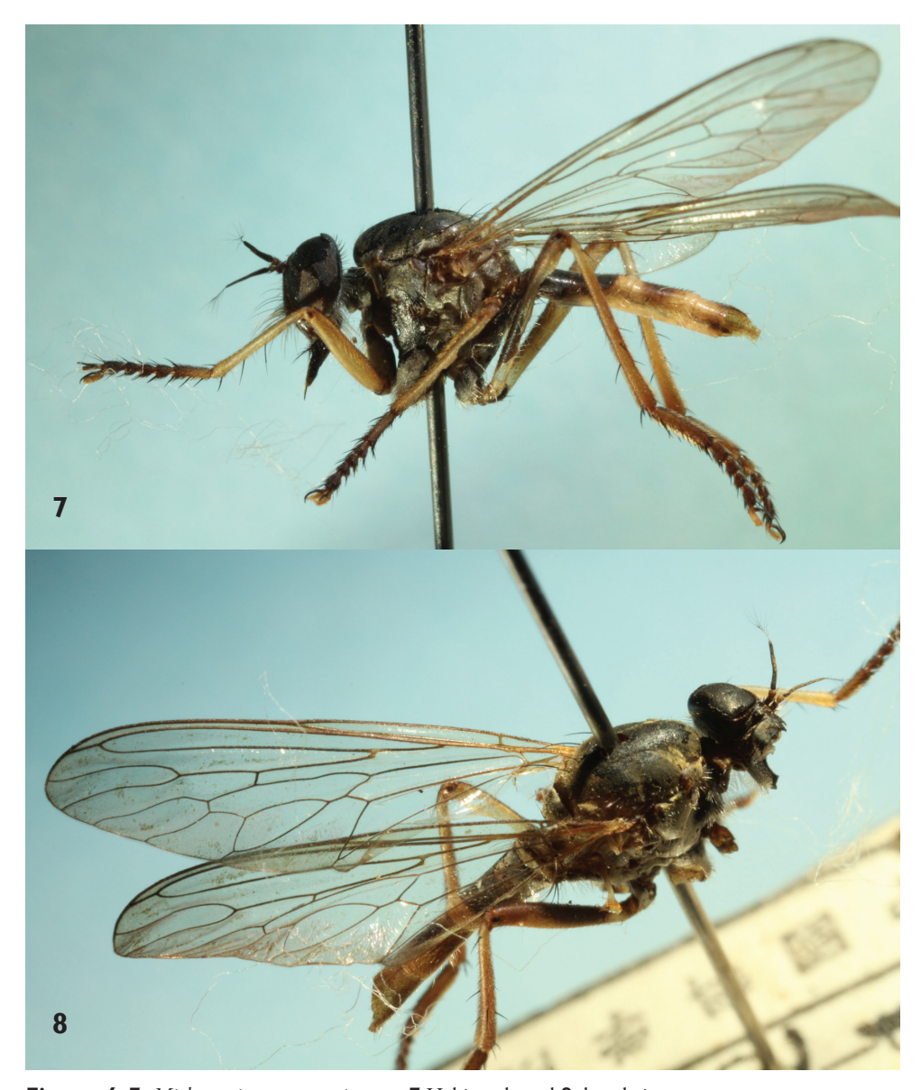
Figures 6-7. Michotamia yunnanensis sp. n. 7 Habitus, lateral 8 dorsal views.

bined characters of the terminalia, especially the shape of the epandrium (Figs 2-5). In M. assamensis , the fore and mid femora are yellowish-orange ventrally and posteriorly, black dorsally and anteriorly from base to near apex, the hind femur is mostly black with the narrow base yellowish-orange, and the wing is dark brownish-yellow and basal 1/3 of the anal lobe is hyaline (Joseph and Parui 1995, 1998).